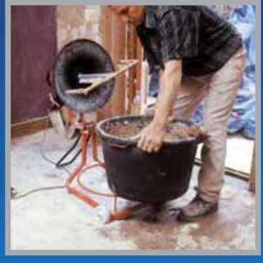
Easily Manageable Tub