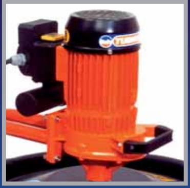
Maintenance Free Motor