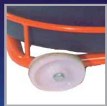
Wheels For Easy Transportation